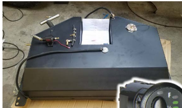
Tank shown has supplemental coating.