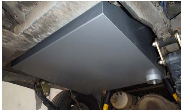
Suitable for fuel injected motors.

This replacement tank kit from Long Range Automotive of Melbourne, Australia was developed to meet the needs of North American pick up owners. The goal? To provide additional fuel capacity from a high-quality aluminized steel replacement tank that integrates seamlessly with factory fuel systems and emission controls in North American vehicles.